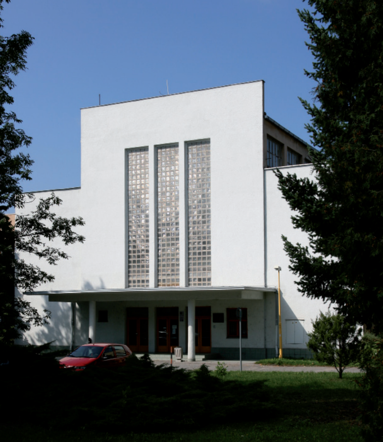
2. Czechoslovak Exhibition (1938), pavilion, now Mining Faculty of the Technical University in Kosice.

of the Hungarian Secession coupled with the Modern-Movement-style inner layout and the use of modern materials: metal, concrete, glass-block and ceramics.