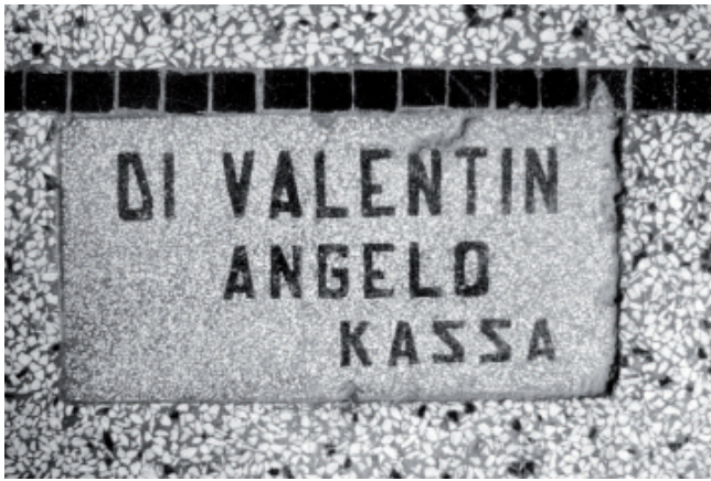
8. Detail of terrazzo pavement with Valentin di Angelo's signature in the entrance hall of the „Nine-storey“.