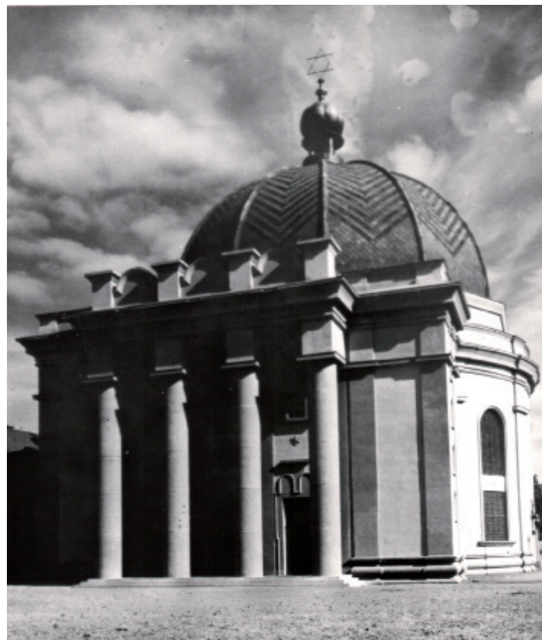
3. The neologic synagogue in Kosice, architect Lajos Kozma, 1927.

At the end of the 19th century there was