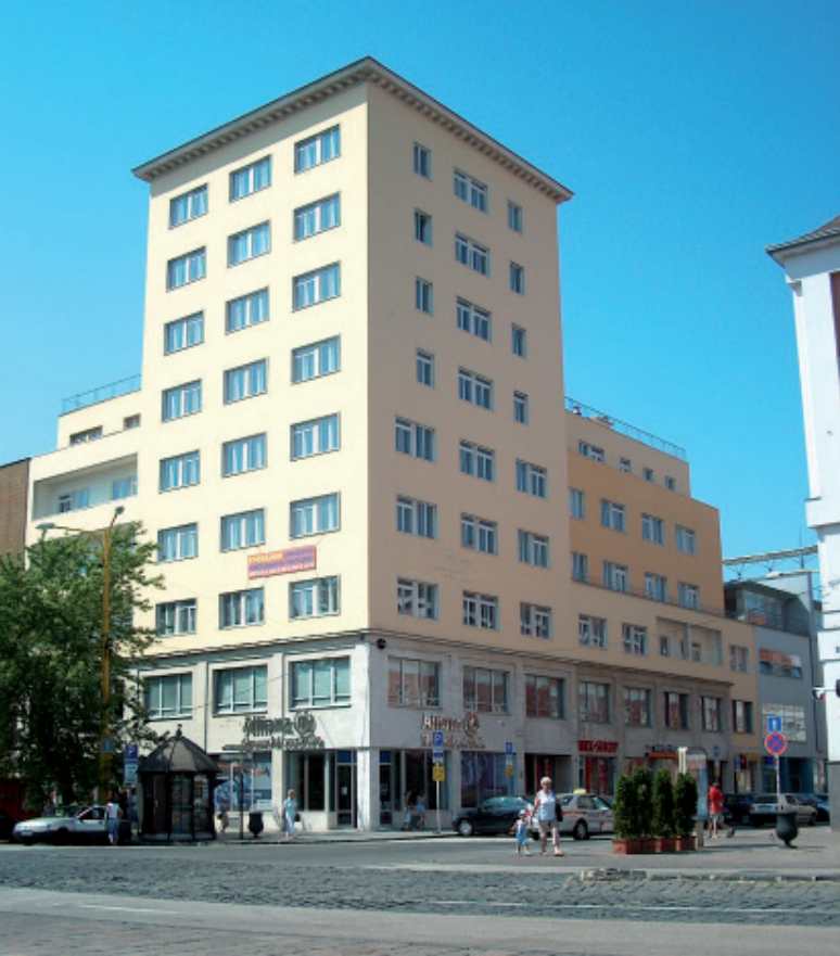
11. The „Nine-storey“ after reconstruction – present state.

changing of the original corridor connecting the two main staircases. The process of this type of “restoration” illustrates the nonsense of modernisation, during which recent quality handicraft is replaced by what is fashionable today (e.g. terrazzo pavements or artificial stone elements, “repairing” veneered interior doors by giving them a coat of paint in various colours, replacing well-kept stone-sheeting with new travertine instead of cleaning and conserving the original one. The owner planned to replace all