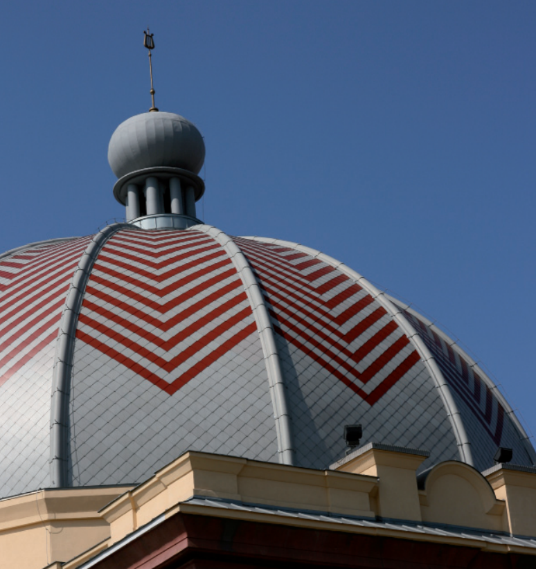
6. The dome roof after reconstruction.

elements and details. It is just a surprise that the new solution of the construction of the inner dome did not touch the well-kept original dome structure, which is now hidden by the suspended