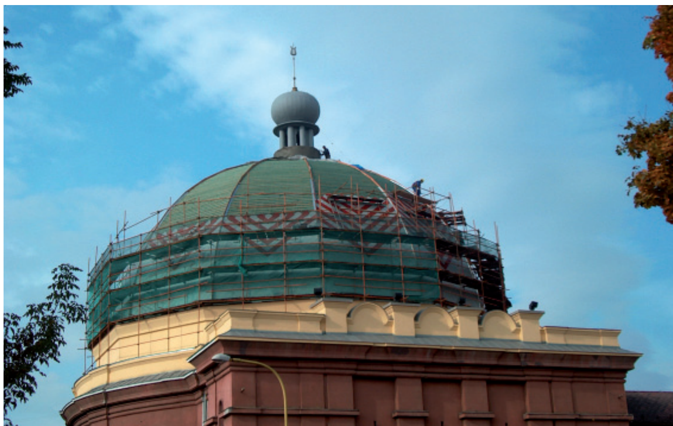
5. The reconstruction works on the roof of the dome in 2005.

The western façade is now shaped with a portico with cubic columns – the change of the historicistic design toward a more fashionable sober elementary conception brought a new architectural value, in spite of the radical rebuilding, accented by high quality crafts-