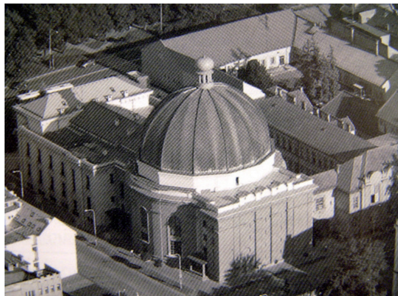
4. The neologic synagogue converted to a concert hall „The House of Art” in Kosice, rebuilt from the 1958 to the middle of the sixties of the 20th century.

The original function of the synagogue lasted till WWII, later it was seized by the state and for a short time it was used as a granary. The first plans for its rebuilding to a concert hall date from 1953 – this first monumental design was not realised: it planned a late Historicism-style colonnade (elements of Neo-Barrocque and Neo-Classicism) as two flanking wings on both sides. The final plan from 1957-58 used a more simple