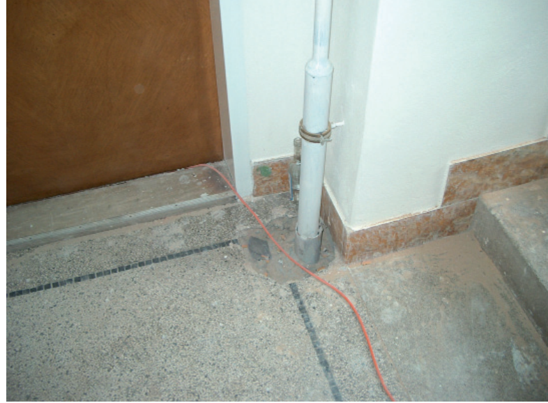
9. Detail of terrazzo pavement destruction in the interior of the main staircase during the reconstruction.

corner: the six-storey part in the street-line is accented by the nine-storey high-rise at the corner: the ground floor and the 1st floor are for commercial use (shopping and administration), the other (higher) floors are used for flats.