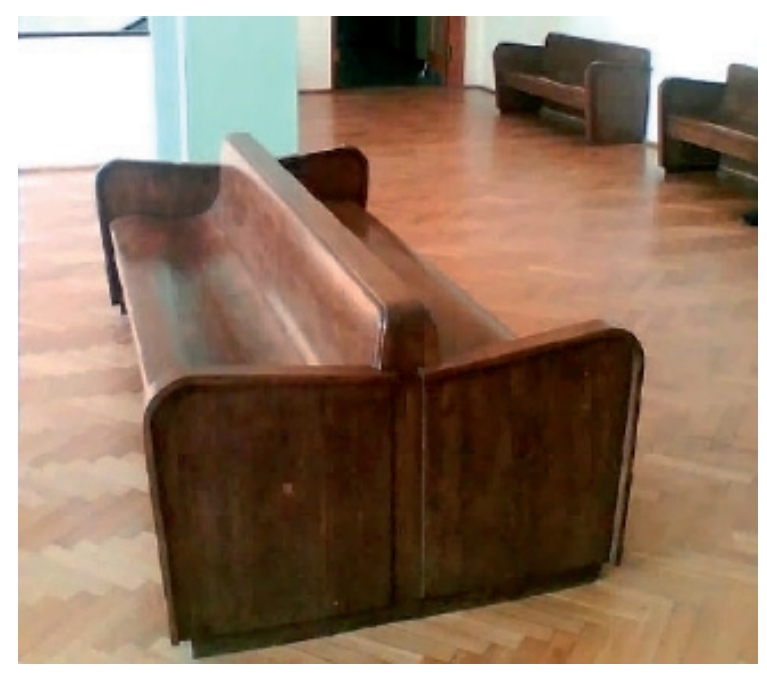
5. Benches inside the District Court building.