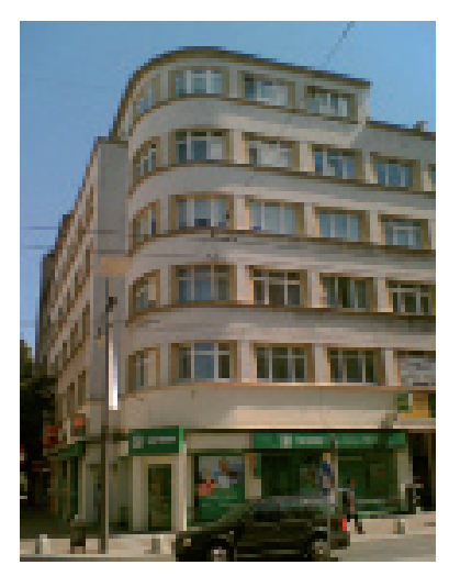
6. Tenement house at 89, Świętojańska and 2, I Armii Wojska Polskiego.