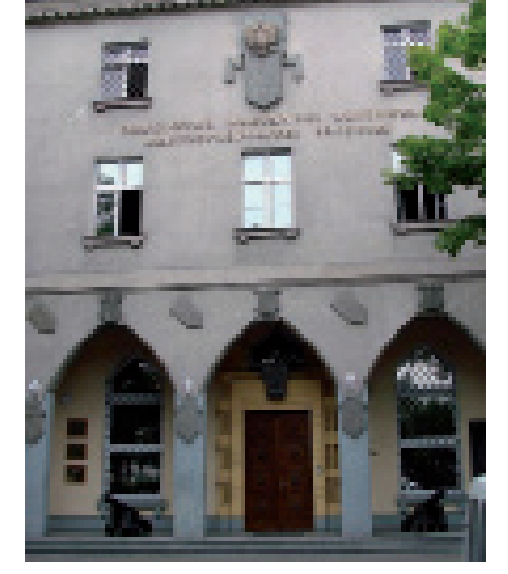
2. Façade of the Navy Headquarters.