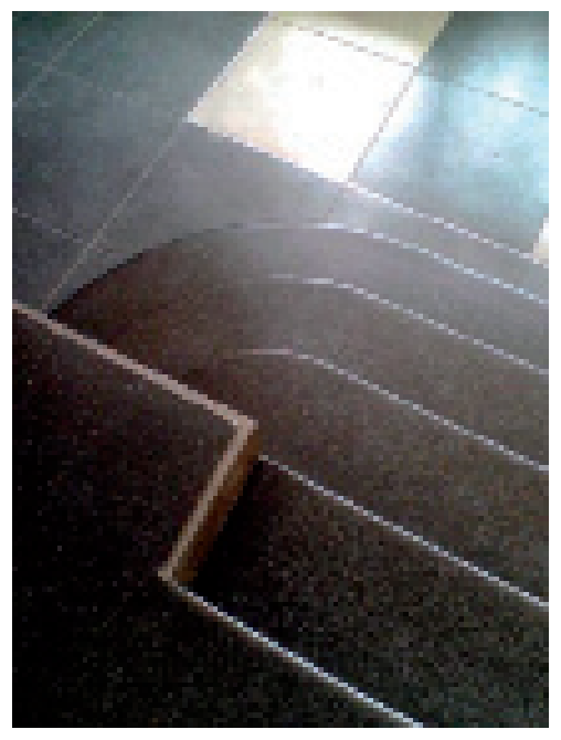
4. Interiors of the District Court building.