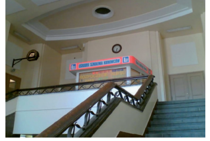
1. Interiors of Gdynia Railway Station.