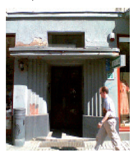
8. A stone portal at 59, Świętojańska.

And it is in Kamienna Góra where you can find a true gem of Gdynia Art Déco which is a magnificent exception to the rule (Fig. 9): it is a two-storey building with a steep roof. Its composition reconciles motifs of British Art Nouveau and Wright's 'prairie houses', roof tiles, bricks, rubblework walls, and flat reinforced-concrete cornices: a mix bonded together with the spirit of Art Déco into an impeccable stylistic whole.