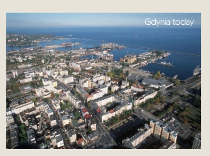
Gdynia today is a modern city with a population of a quarter-million and a major port in the Baltic. The city centre, designed and built in the 1920s and 1930s, is a major Modern Art monument in Poland. Modern Art concepts survived the turmoil of WWII, so many examples of valuable architecture were erected also after the war.

In 2007, Gdynia City Hall together with the Faculty of Architecture, Gdańsk University of Technology organised the first international conference "Modernism in Europe - Modernism in Gdynia. Inter-war Architecture and Its Preservation." The conference was held under the honorary sponsorship of the Minister of Culture and Polish National Heritage, and was co-organised by the Preservation Theory Section of Polish National Committee ICOMOS. Sponsorship was also provided by DOCOMOMO (Documentation and Conservation of Modern Movement). The conference was attended by researchers from eight countries, among them DOCOMOMO officials.